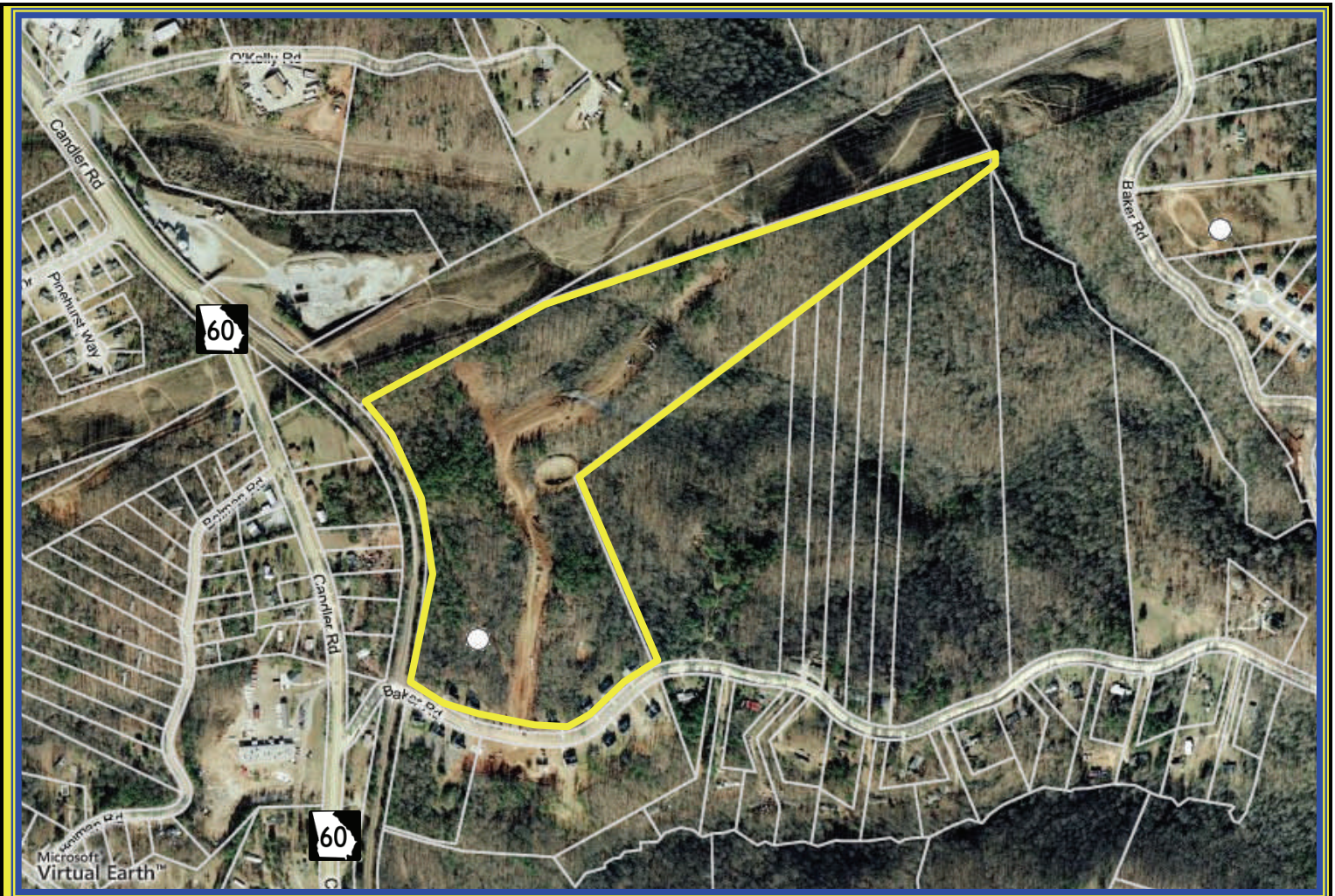
Photograph Taken Prior to Development